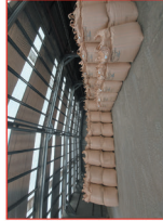
JUMBO BAG (1.5 - 1.7t)