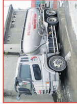
BULK TRUCK (13 - 15t)

AVAILABLE AT PNG TAIHEIYO YARD, AES INDUSTRIAL PARK, RAVUVU, PNG