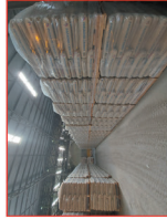
40KG BAG - PALLET