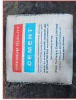
40KG PREMIUM CEMENT